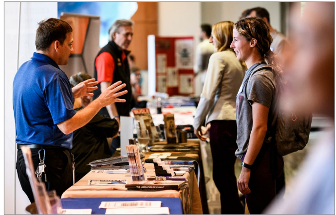
UW-Madison Veteran Services Welcome Event

in better understanding and helping to improve their academic and early-career experiences.” For more information see: https://wcer.wisc.edu/news/detail/new-wcer-project-explores-academic-and-career-pathways-of-undergraduate-mil